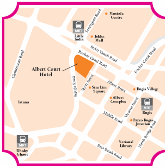
Albert Court Hotel