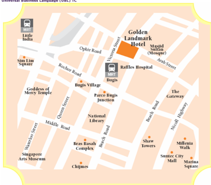
Golden Landmark Hotel