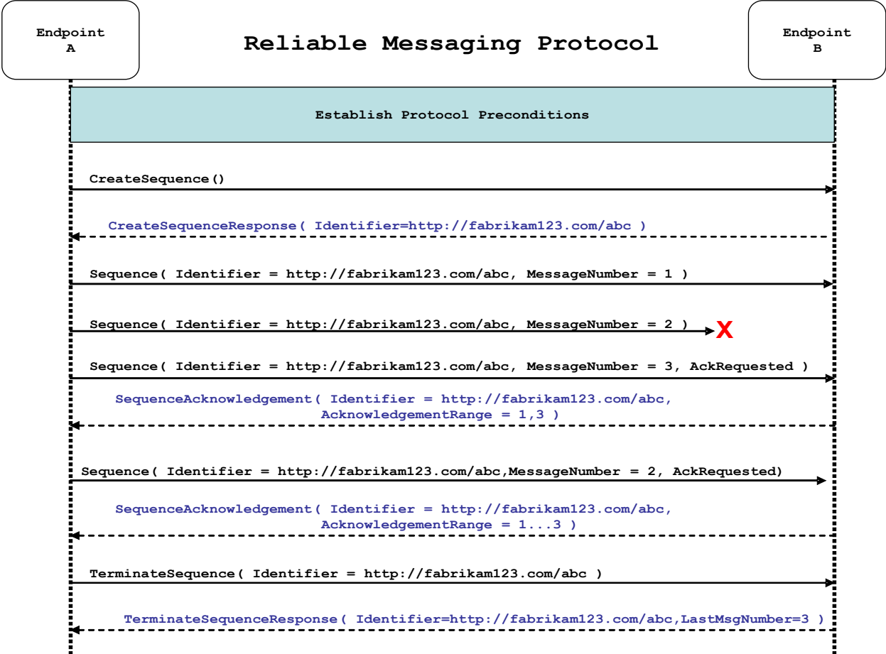
Figure 2: The WS-ReliableMessaging Protocol

Figure 2 illustrates a possible message exchange between two reliable messaging Endpoints A and B.