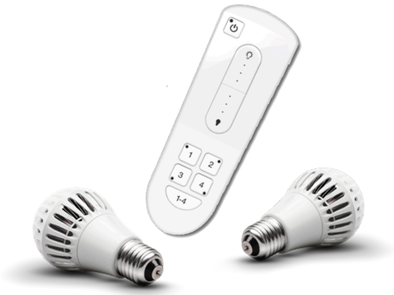
Figure 1: Remote Lighting Network ready for installation

Energy-efficient network light bulbs you can install into standard light fixtures.