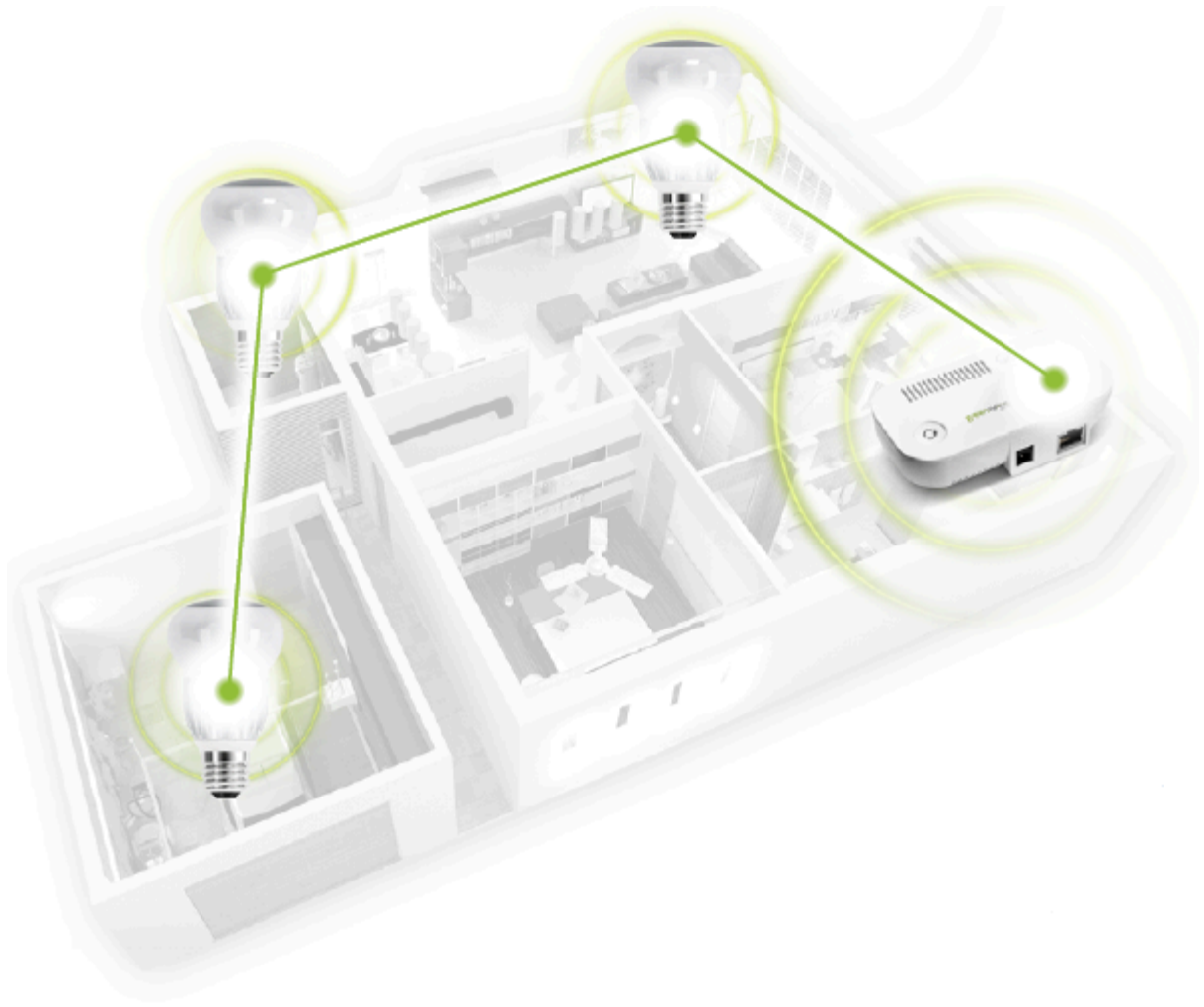
Figure 3: Wireless lighting passing information across light bulbs

Since wireless devices on a low-power network have built-in antennas for radio communication with other connected devices, they may be prone to the same reception problems that you might have with your mobile phone inside a building. Your remote control can have trouble communicating with the network lighting if their radio signals are blocked by obstacles such as large metal panels or walls containing wire mesh.