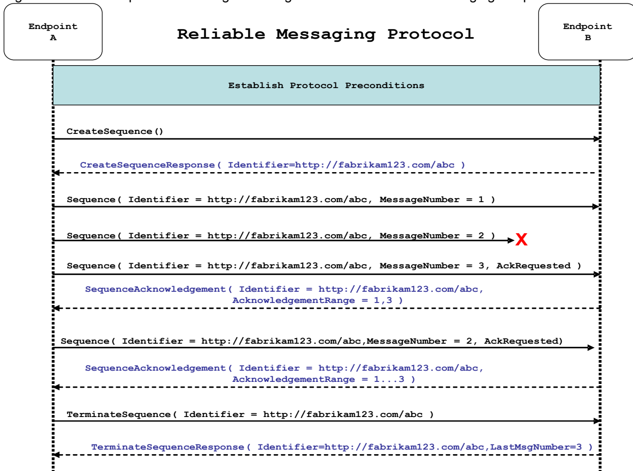
Figure 2: The WS-ReliableMessaging Protocol

Figure 2 illustrates a possible message exchange between two reliable messaging Endpoints A and B.