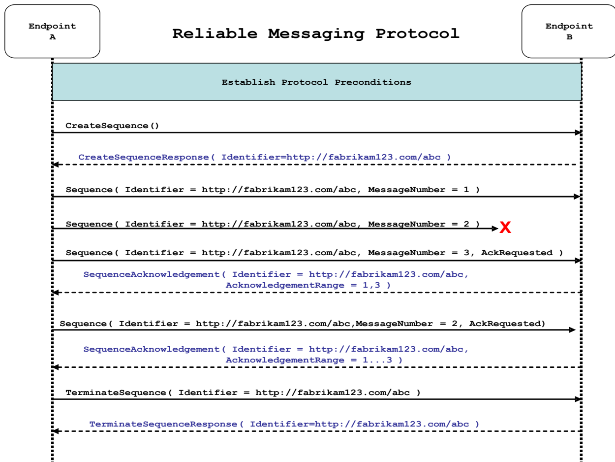
Figure 2: The WS-ReliableMessaging Protocol

Figure 2 illustrates a possible message exchange between two reliable messaging Endpoints A and B.